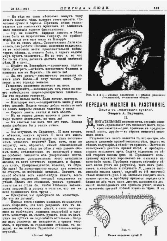
Figure 4.1 One of A. Barchenko's (А.Барченко) articles on mental suggestion and thought transmission published in 1911. "ПЕРЕДАЧА МЫСЛЕЙ НА РАСТОЯНІИ" (DISTANCE THOUGHT TRANSMISSION).